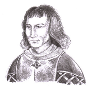
Henry Holland Duke of Exeter, 1430–75

Blocks listed as Enemy Noble have two versions, one YORK and one LANCASTER. The enemy version starts the game as an enemy block, but can change sides with Treachery Rolls (6.9). Keep your version off-map along the east edge of the map until a defection occurs.