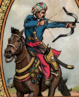
Ottoman Scythian Archer