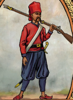
Ottoman Line Infantry