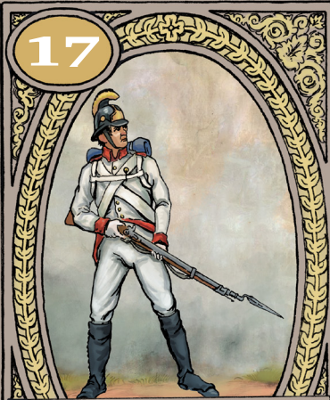
Austria Line Infantry