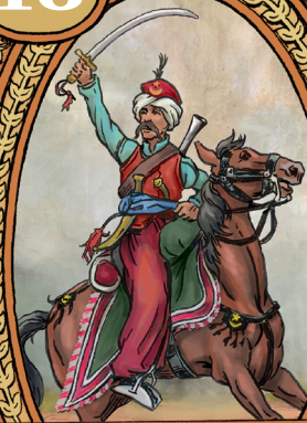
Ottoman Mamluk Cavalry