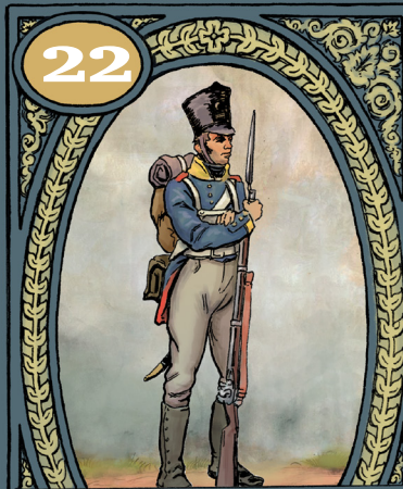
Prussia Line Infantry