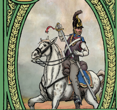
Russia Heavy Cavalry