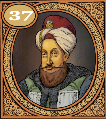
Selim III PANIC 1 Enemy Infantry does not fire in 1 battle in Round 1