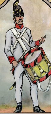
Austria Light Infantry Drummer