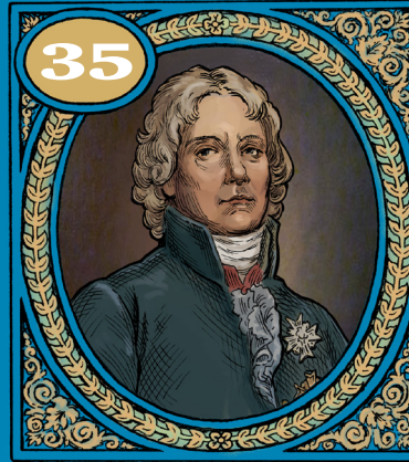
Tallyrand DIPLOMACY +2