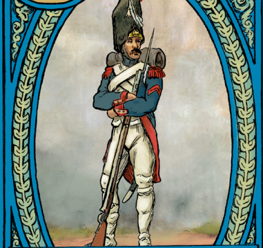
France Old Guard