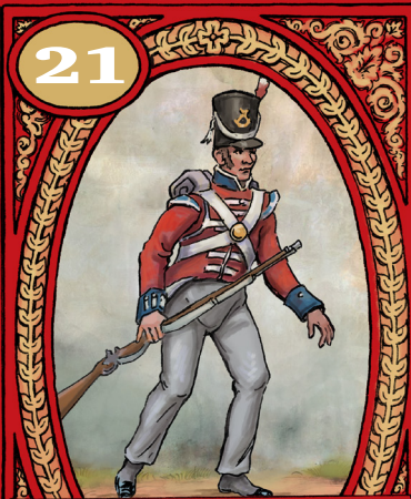
Britain Foot Guard