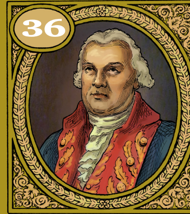
Cuesta BRIDGE CAPTURE +1 Fire in Round 1 for 1 Infantry crossing a River