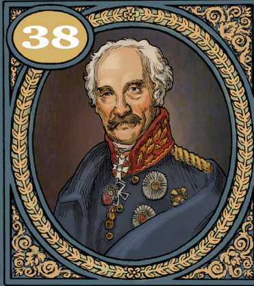
Blücher CAVALRY CHARGE +1 Fire in Round 1 for 1 Cavalry Block