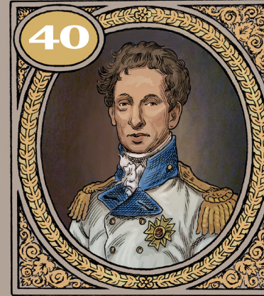
Archduke Charles ALPINE GUIDE One Mountain Border Limit 3