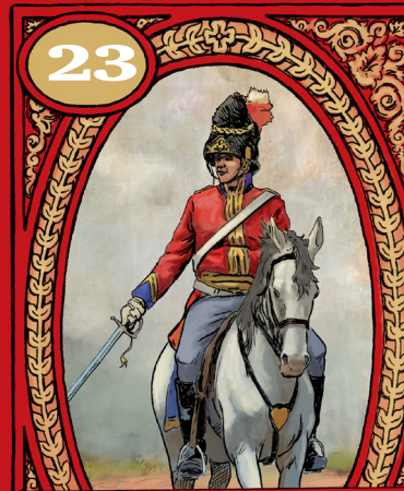
Britain Royal Scots Greys