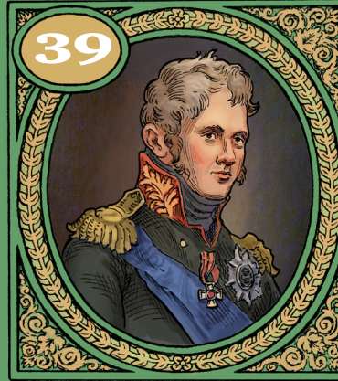
Czar Alexander BAYONET CHARGE +1 Fire in Round 1 for 1 Infantry Block